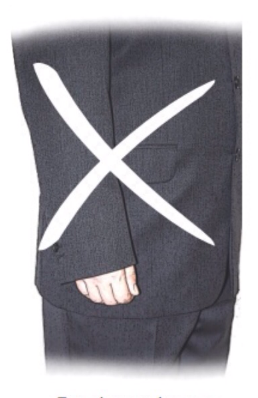
Too long sleeve