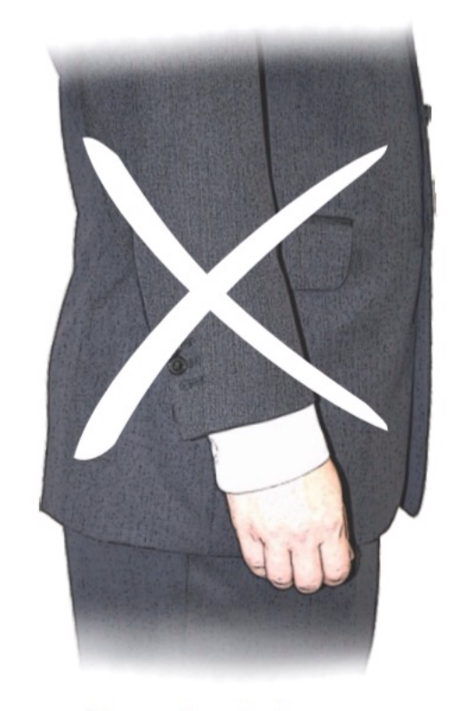
Too short sleeve