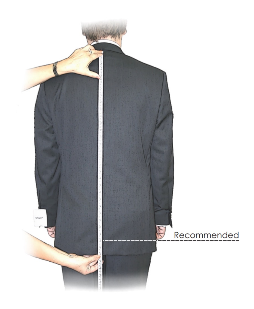
Page 3 of 5